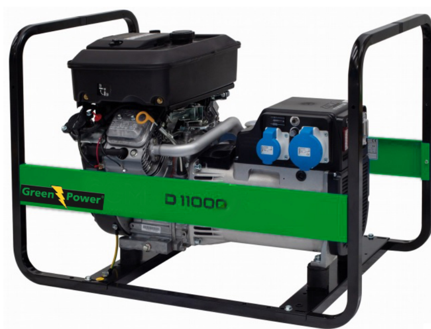
The image is only for demonstration purposes

3000 rpm gensets have been designed for stand-by use only. Not recommended using for more than 6 hours continuously or more than 500 hours/year.